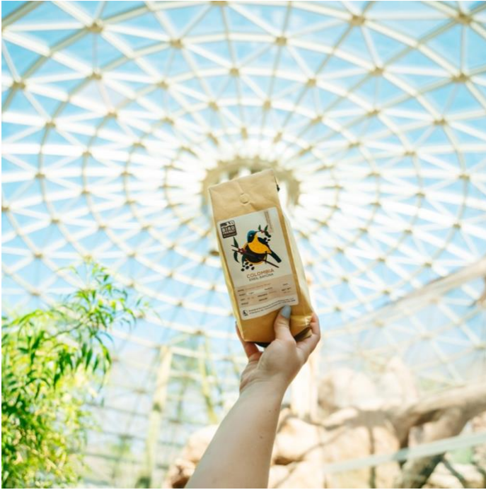
Bird-Friendly Certified Colombian Single Origin